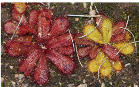
Drosera bulbosa subsp bulbosaa

All but one will die back and go dormant in summer. Rest the pot in shade then, letting it dry out, but not bone dry; moisten the surface once a week. Keep them wet but not boggy once they emerge and give them plenty of sun. The long ones can vine over a trellis easily enough.